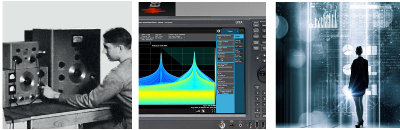
From Hewlett-Packard to Agilent to Keysight

Our unique combination of hardware, software, support, and people can help you reach your next breakthrough. We are unlocking the future of technology.