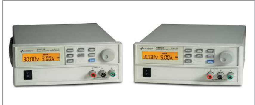
Figure 1. The U8001A 90 W and U8002A 150 W single output DC power supplies