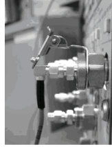
Figure 3. Cable connection.