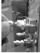
Figure 2. Shorting test cable.