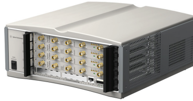
U1056B Data converter system

For creation of an integrated Compact PCI system, including chassis, interface or single board computer, please refer to the U1056B product.