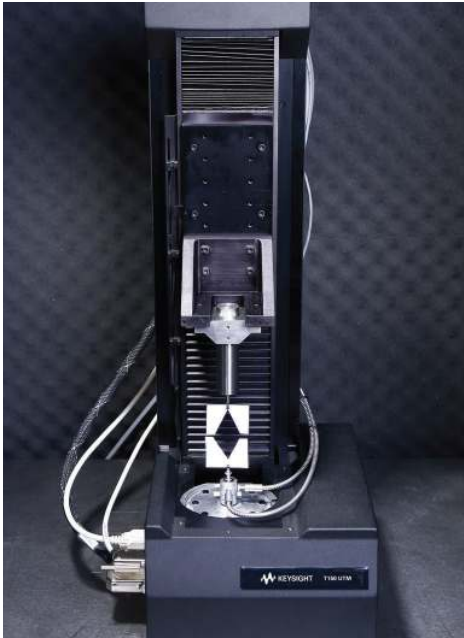
Keysight CDA option