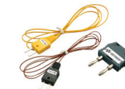
U1180A Thermocouple adapter/lead kit