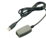
U1173A IR-to-USB cable