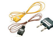
U1180A Thermocouple adapter/lead kit