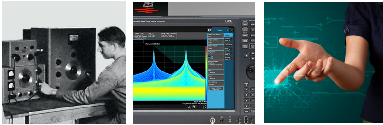
From Hewlett-Packard to Agilent to Keysight

Our unique combination of hardware, software, support, and people can help you reach your next breakthrough. We are unlocking the future of technology.