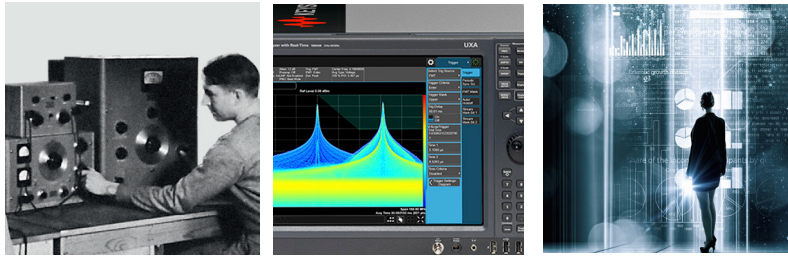
From Hewlett-Packard to Agilent to Keysight

Our unique combination of hardware, software, support, and people can help you reach your next breakthrough. We are unlocking the future of technology.