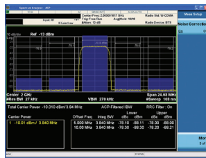
Figure 2. 78 dB W-CDMA ACLR dynamic range