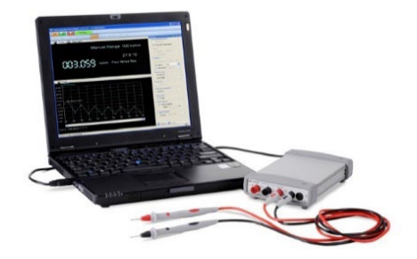
Figure 2. U2741A used as a standalone instrument

Keysight U2700A series USB Modular Instruments won Design News' Golden Mousetrap Award in the 2009 Best Products Category. Design News' Awards program highlights engineering innovation and product design creativity and honors the best designs of the past year.