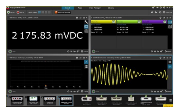
Figure 4. View measurements across USB DAQ, modular and bench instruments all on one BenchVue interface

The USB Modular Digital Multimeter App within BenchVue allows you to quickly configure and control the U2741A DMM to visualize measurements, perform data logging and annotate captured data. With BenchVue, you can display single measurements, charts or tables, from either a single U2741A DMM or multiple U2741A DMMs simultaneously to correlate trends you might otherwise miss. In just a few clicks, you can also record measurements and export results to popular PC-friendly applications such as Microsoft Excel and Microsoft Word for further analysis.