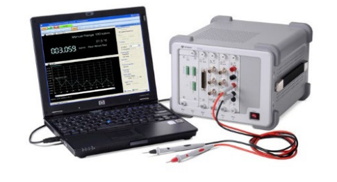
Figure 3. U2741A used as a modular instrument

*Note: The U2741A needs to be powered on with an AC adaptor.