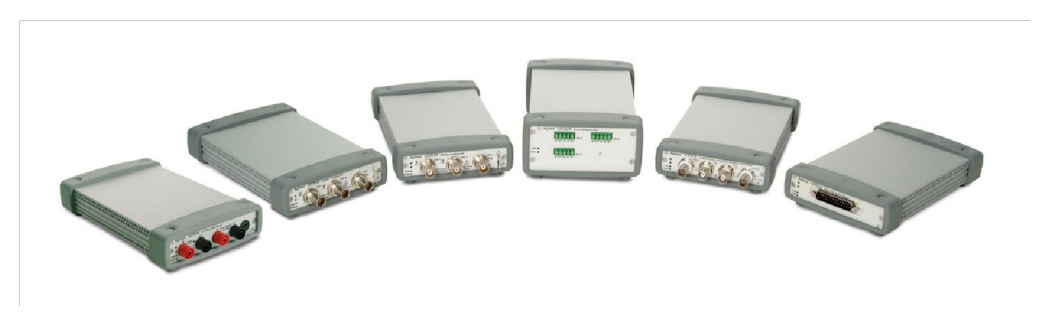
Figure 1. Keysight's USB Modular Instrument (MI) family

The next time you're called out to solve tough problems in electronic products or processes, leave the bulky transit cases behind. With Keysight Technologies, Inc.'s USB modular instrument (MI) family, you can easily carry powerful test gear in your bag along with your laptop PC. Our line of MIs includes two oscilloscopes, a DMM, a function generator with arbitrary waveform capability, a source/measure unit and a 4x8 switch matrix. All provide USB 2.0 connectivity (with USBTMC-USB488) standard and plug-and-play simplicity for easy use on the go or on the bench.