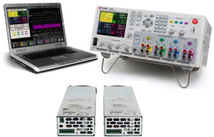
Figure 3. Keysight N6781A and N6785A Battery Drain Analyzer is a two-quadrant source and measure unit (SMU) module that plugs into N6705B DC Power Analyzer mainframe and 14585A Control and Analysis Software is a turnkey solution for battery run-down tests on battery powered medical devices

With the Keysight 14585 Control and Analysis Software, a battery run-down test can quickly be set up and the run-down measurements can be captured and plotted without coding any software.