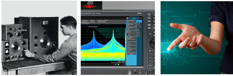
From Hewlett-Packard to Agilent to Keysight

Our unique combination of hardware, software, support, and people can help you reach your next breakthrough. We are unlocking the future of technology.