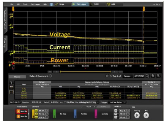
Figure 4. Battery run down test result