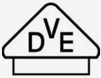
German Association for Electrical, Electronic & Information Technologies (VDE)

Before you purchase a new handheld DMM, remember to check for the symbol of a recognized testing organization. Those symbols can only be used if the product successfully completed testing to the agency's standard, which is based on national/international standards. Normally, you can find this distinctive marking at the back of the meter. Similarly, the multimeter probes should also be marked with a logo of a third-party safety agency.