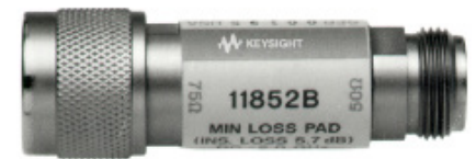
Keysight 75-ohm test accessories