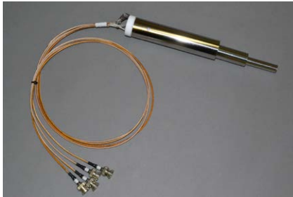
DPT-013 for liquid, powder