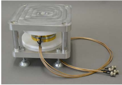
DPT-080 for sheet