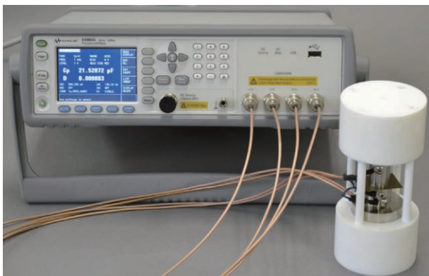
E4980A Precision LCR Meter and DPT-009 for sheet, liquid, gel