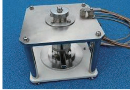
DPT-2141 for sheet, plate (JIS-C2141 compliant)