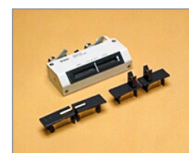
16047A test fixture