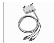
16089B Kelvin clip lead