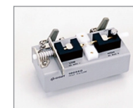
16034G SMD test fixture