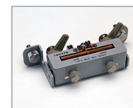
16047E test fixture