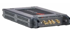
Keysight Streamline Series USB Vector Network Analyzers (P937xA, P500xA)