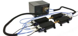
E-band network analyzer system N5252A