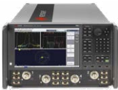
Vector network analyzer PNA series (N52xx) ENA series (E50xx)