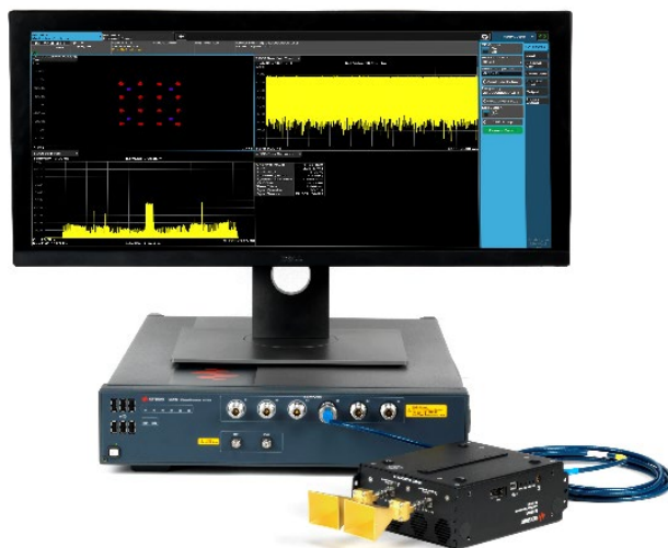
Figure 1: E7760B and M1740A for IF and mmWave 5G testing

Non-signaling test is useful for verification of baseband, IF, RF and mmWave modules before protocol firmware is added. Keysight's mmWave 5G non-signaling solution ensures a streamlined approach to reliably verify transmit and receive paths between IF and mmWave frequencies.