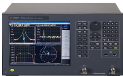
RF NA Options (Opt.115,215,135,235,117, 217,137,237)