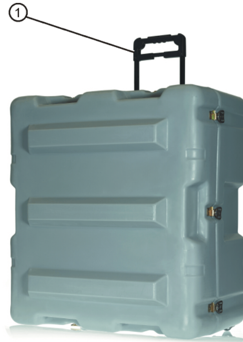
Figure 3 Transit Case with Handle Extended