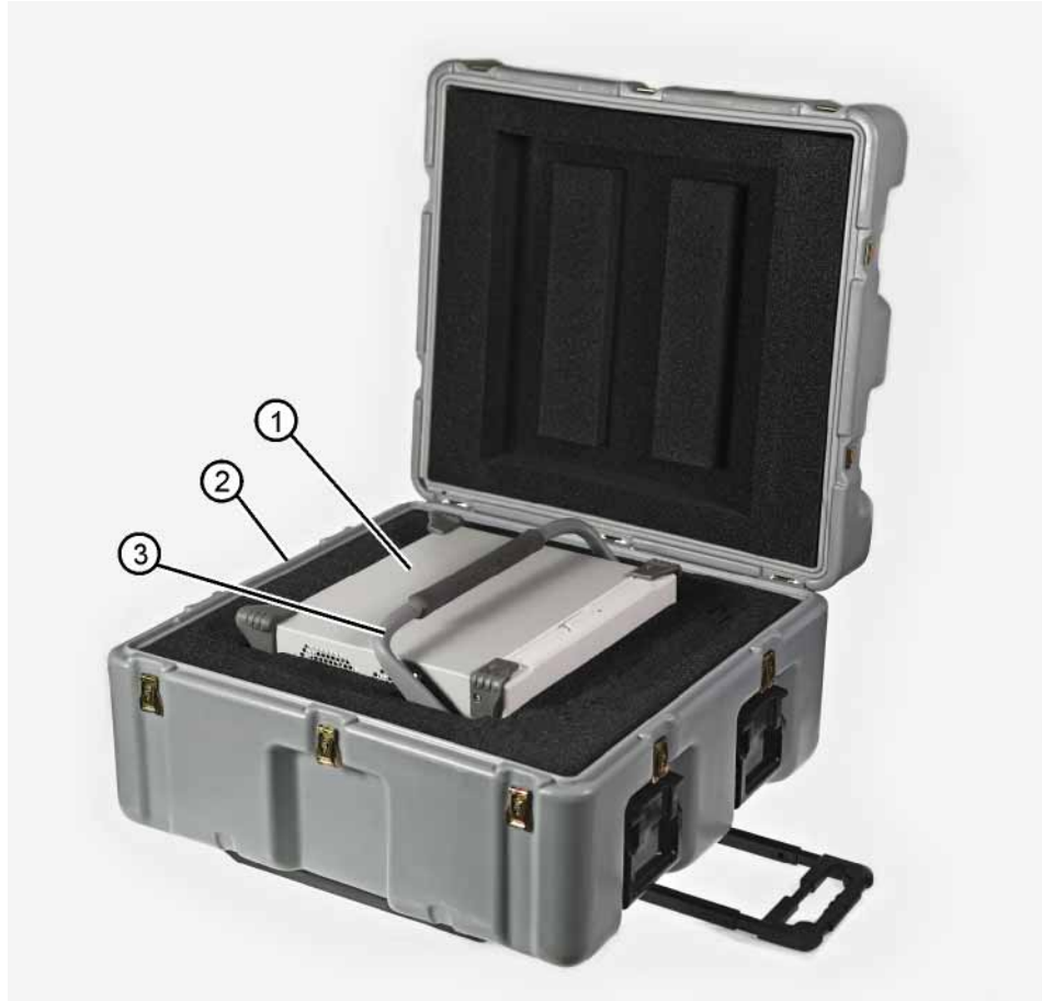
Figure 1 Signal Analyzer in Transit Case