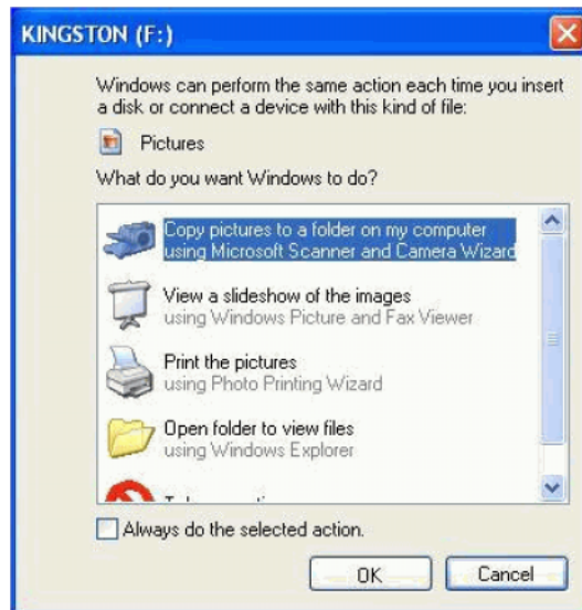
Figure 1 USB Storage Device Configuration Menu