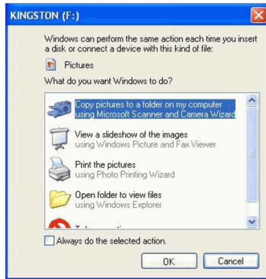
Figure 1 USB Storage Device Configuration Menu