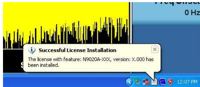
Figure 2 Successful License Installation