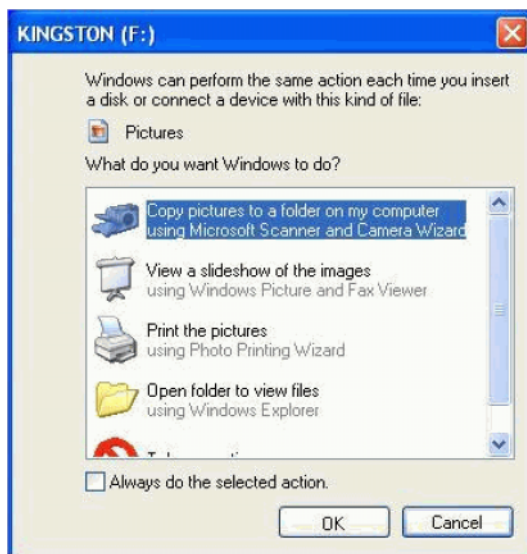
Figure 1 USB Storage Device Configuration Menu