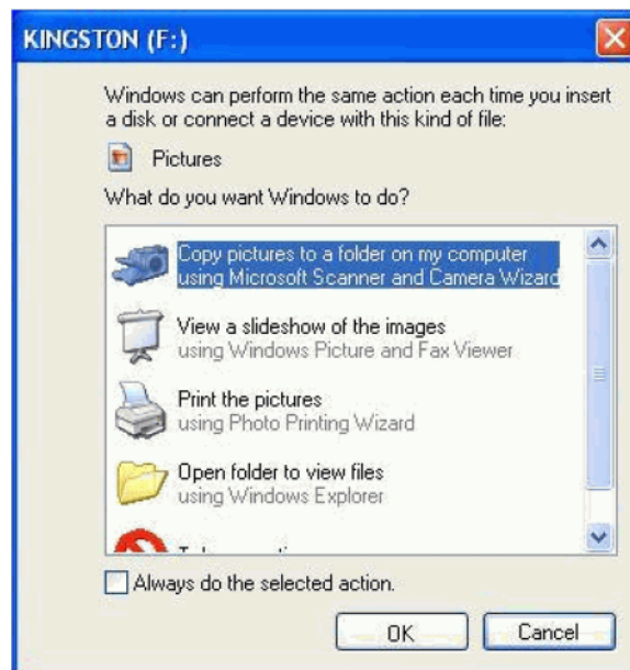
Figure 1 USB Storage Device Configuration Menu