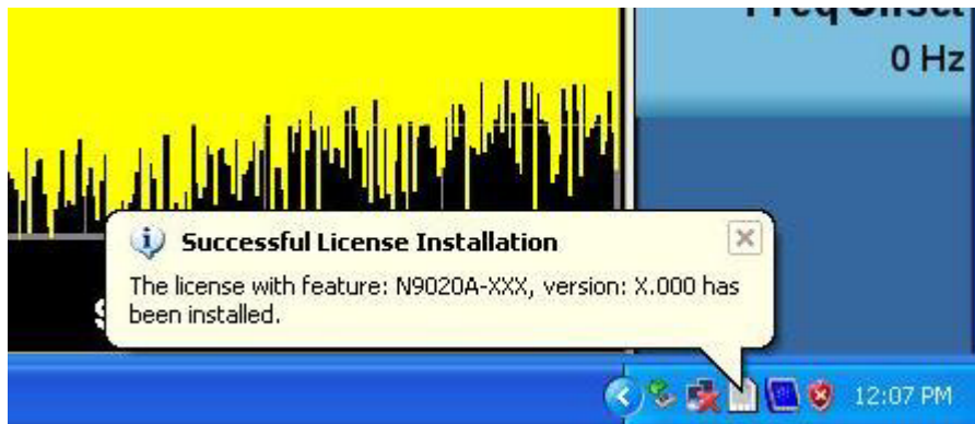
Figure 2 Successful License Installation