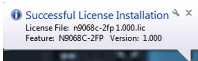
Figure 2 Successful License Installation