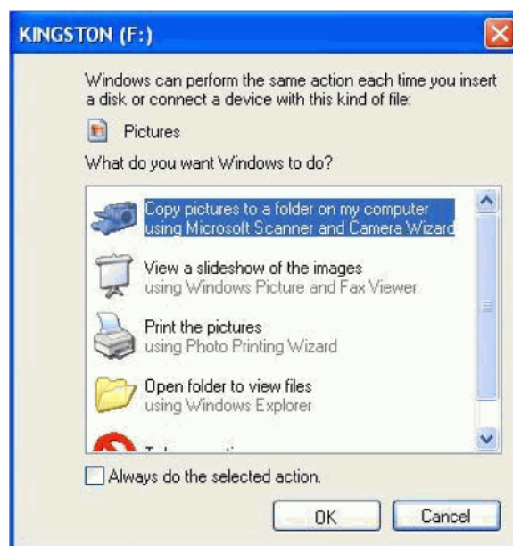
Figure 1 USB Storage Device Configuration Menu