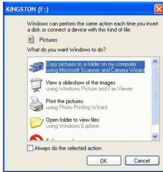
Figure 1 USB Storage Device Configuration Menu