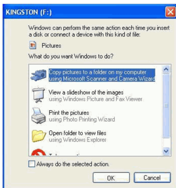
Figure 1 USB Storage Device Configuration Menu